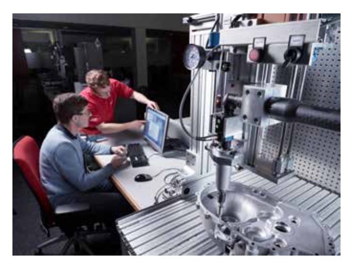
APPLITEC test laboratory